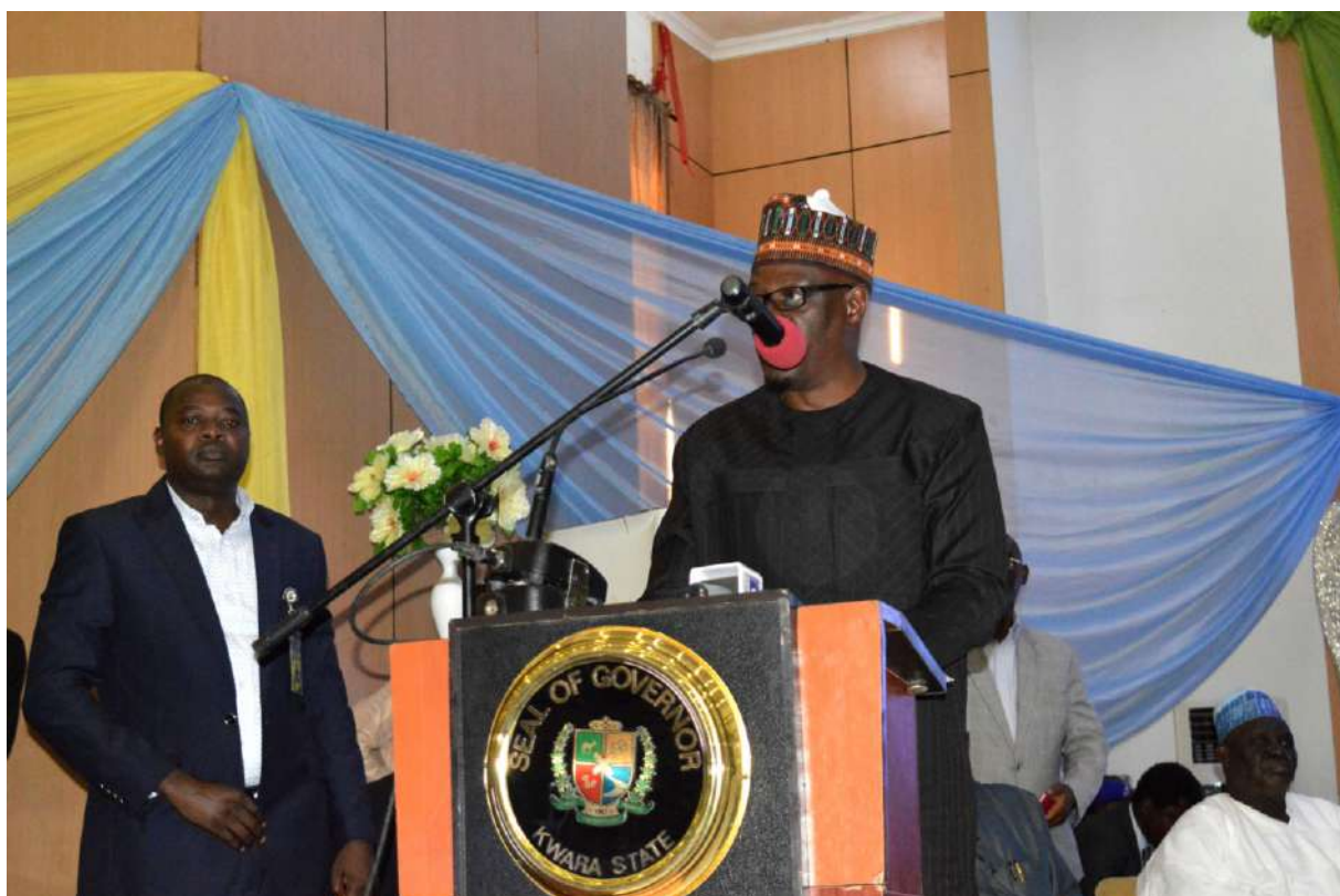
Alhaji (Dr) Abdulfatah Ahmed, Executive Governor, Kwara State

He also said, since the dynamics of jobs has changed in the country, the curriculum in our institutions also needs to change. He expressed his displeasure on the constant growth in the rate of unemployment in the country day by day which amounts to about 34million and counting, and that of Kwara State which is about six hundred thousand.