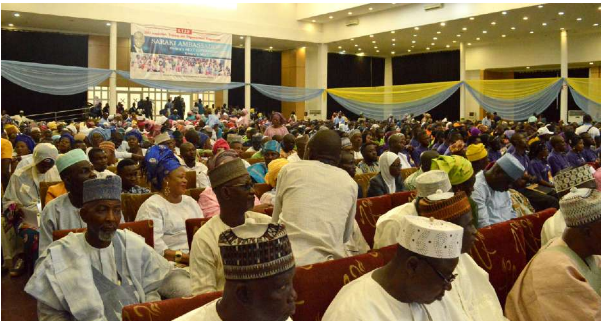
Dignitaries at the inauguration of STEP