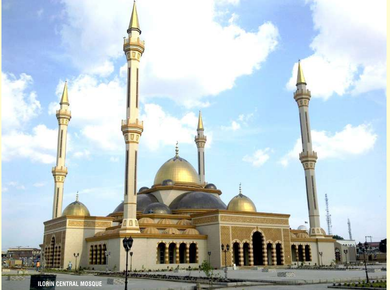
ILORIN CENTRAL MOSQUE