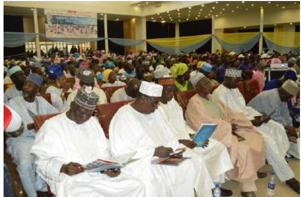
Dignitaries at the inauguration of STEP