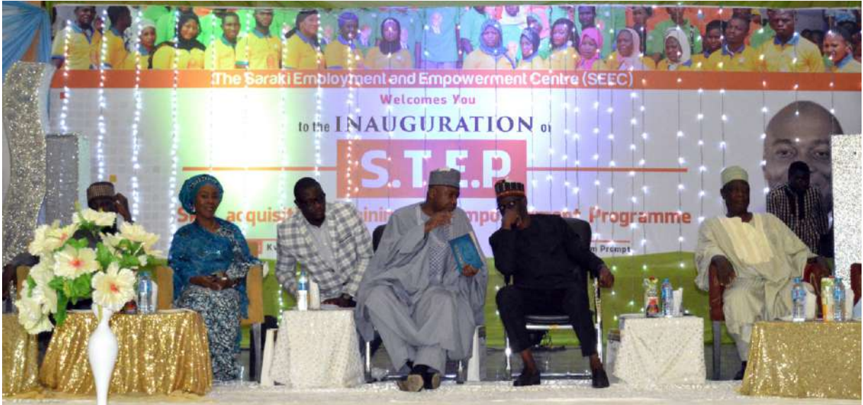
The wife of the Senate President, The Senate President, The Executive Governor of Kwara State and the Deputy Governor at the inauguration of STEP in Kwara State