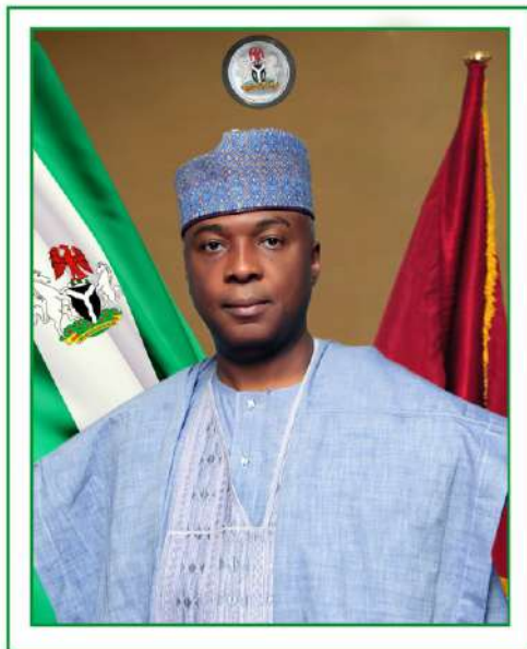
Senator (Dr.) Abubakar Bukola Saraki .CON Senate President, Federal Republic of Nigeria